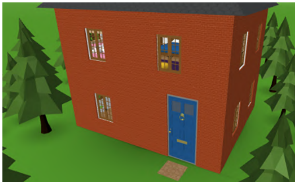
Goldilocks and the Three Bears