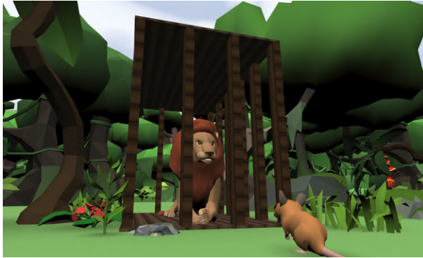
The Lion and the Mouse fable