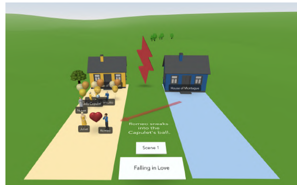
Romeo and Juliet