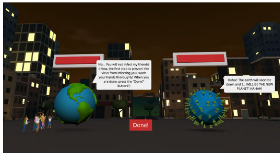
The Earth vs. Covid-19